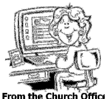
From the Church Office